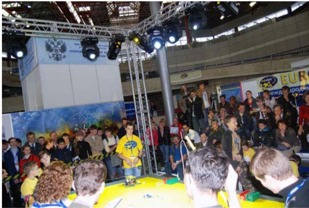
Fig. 9 - exposition guests are very interested in what is going on

Usually after such a party there are tons of rubbish left, isn't it?