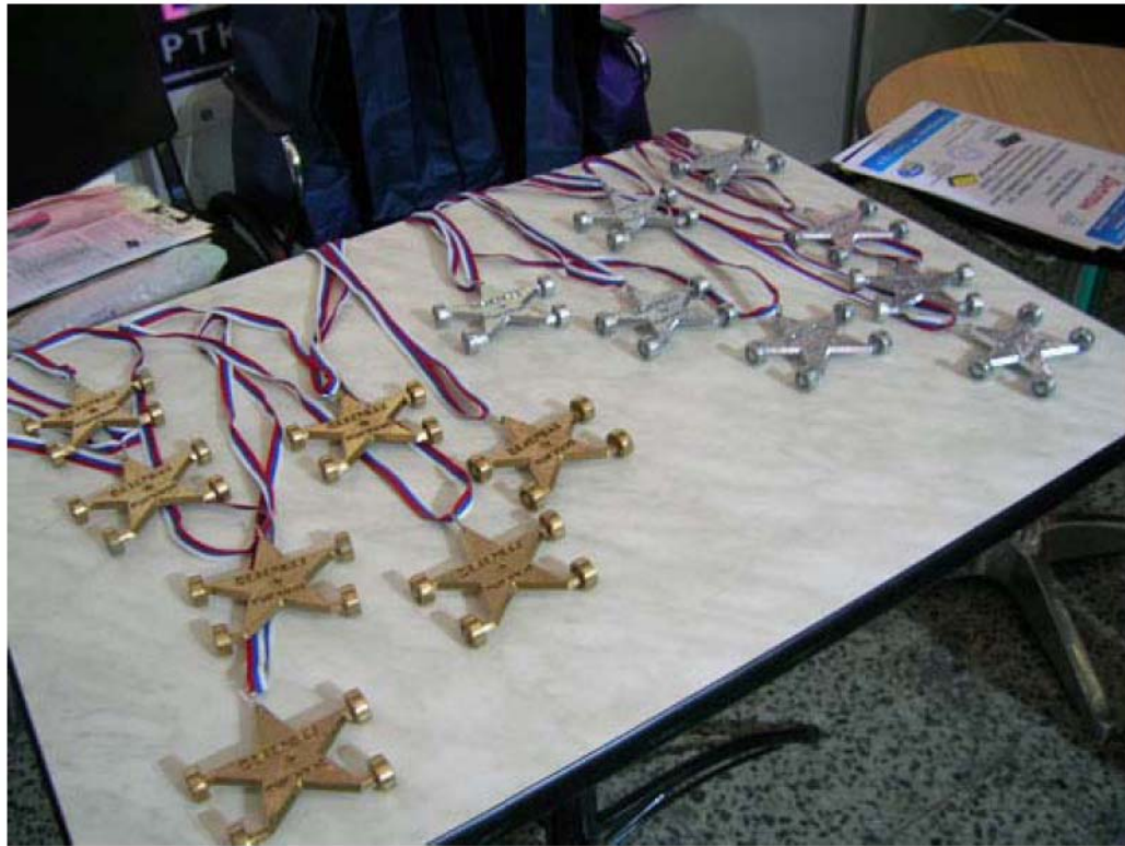
Fig. 14 - Awards