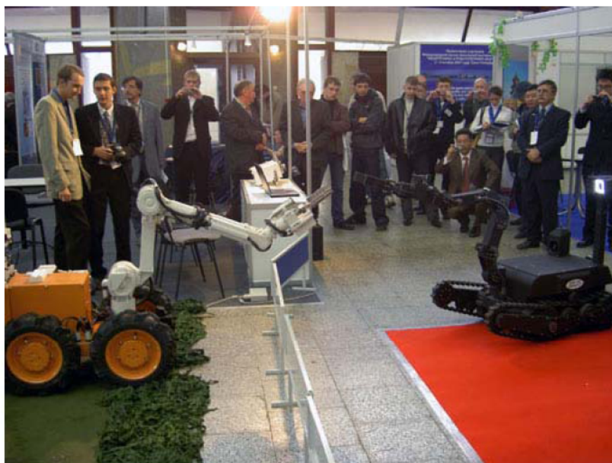
Fig. 6 - Russian robot greets his Chinese “colleague”

Exciting rules and colourful decoration of the Eurobot stand attracted a lot of people. The competition start signal was given by the Central R&D Institute of Robotics and Technical Cybernetics director-chief designer Vitaly Lopota (Fig. 7).