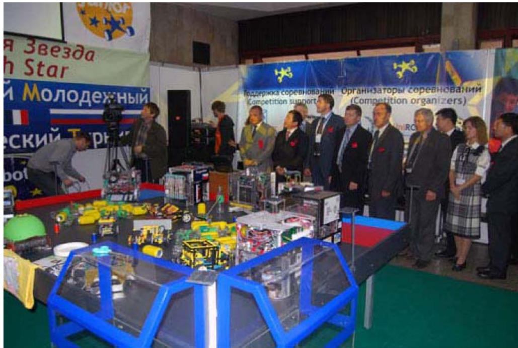
Fig. 7 - competition start