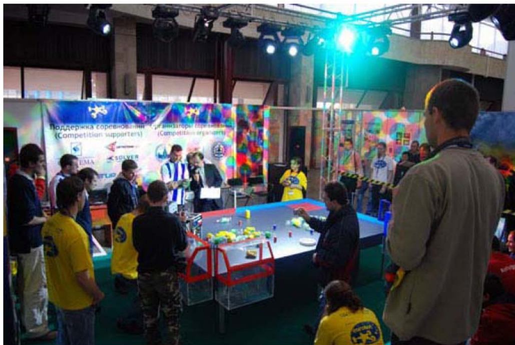
Fig. 8 - playing zone is ready for competition