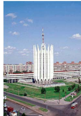
Fig. 5 - in the Central R&D Institute of Robotics and Technical Cybernetics