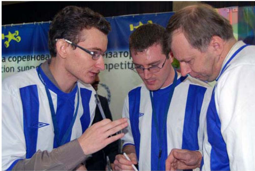
Fig. 11 - international jury team found a common language