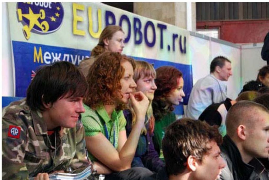
Fig. 10 -public is tense

Usually after such a party there are tons of rubbish left, isn't it?