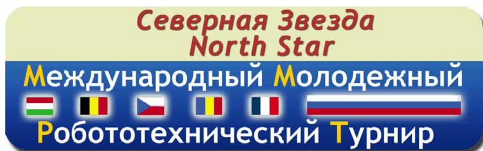
Fig. 4 - Competition «North Star» and participating countries

Gathering friends to come is not always an easy task. Teams from France, Belgium, Romania, Hungary, Czech Republic and Russia took part in the “North Star” tournament.