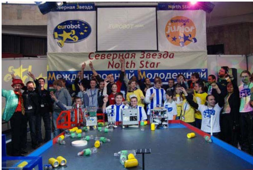
Fig. 15 - Friendship won

Experience which the teams acquired during the four days of the tournament can hardly be overestimated. Young inventors checked their technical solutions, studied the solutions of other teams, got familiar with the best examples of Russian and foreign robotic science, united their teams and got acquainted with young people from other countries.