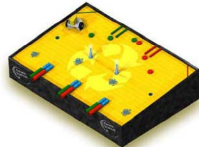
Fig. 3 - Table for rubbish gathering competition «Eurobot Junior 2007»